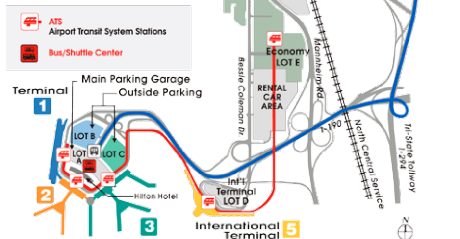
O'Hare International Airport Terminal Map

at www.wisconsincoach.com , at the bus/shuttle center counter or after you board the bus (cash only, $50 bills or less). See Bus Travel on next page.